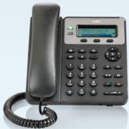
Single line SIP