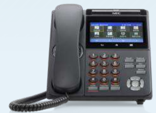
32 lines touch screen

From basic phones to video touch screen phones, NEC has you covered.