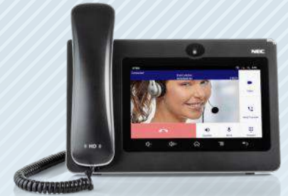
Android based touch screen video phone